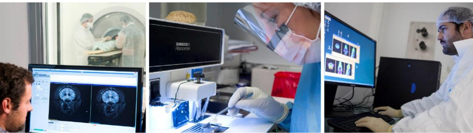
From left to right: Preclinical research involving a 7-Tesla MRI of the brain, MIRCen/CEA/Inserm; immunological study in a high-security microbiology lab, CEA/IDMIT; preclinical research using a PET scan, MIRCen/CEA/Inserm.