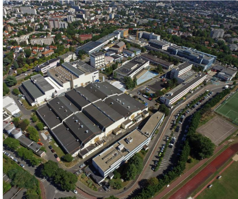
Aerial view of the CEA/Fontenay-aux-Roses site.