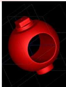
High energy imaging on object of great dimensions or of strong intensity CINPHONIE Plateform